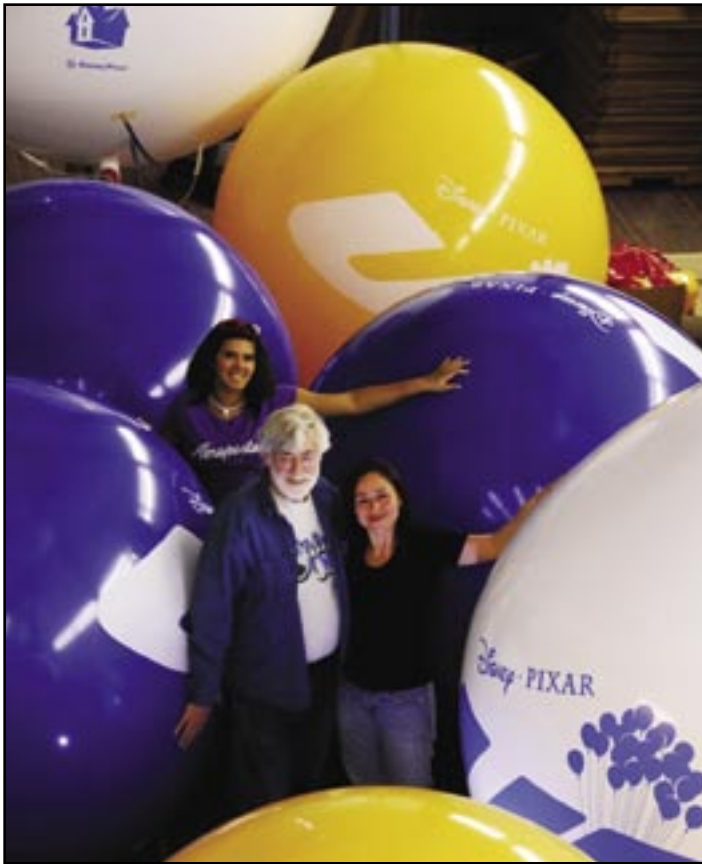
Hall of Fame balloonist Tracy Barnes was brought in to help develop the cluster design and to provide the individually branded cluster balloons, each ranging from 5 to 8 feet in size!