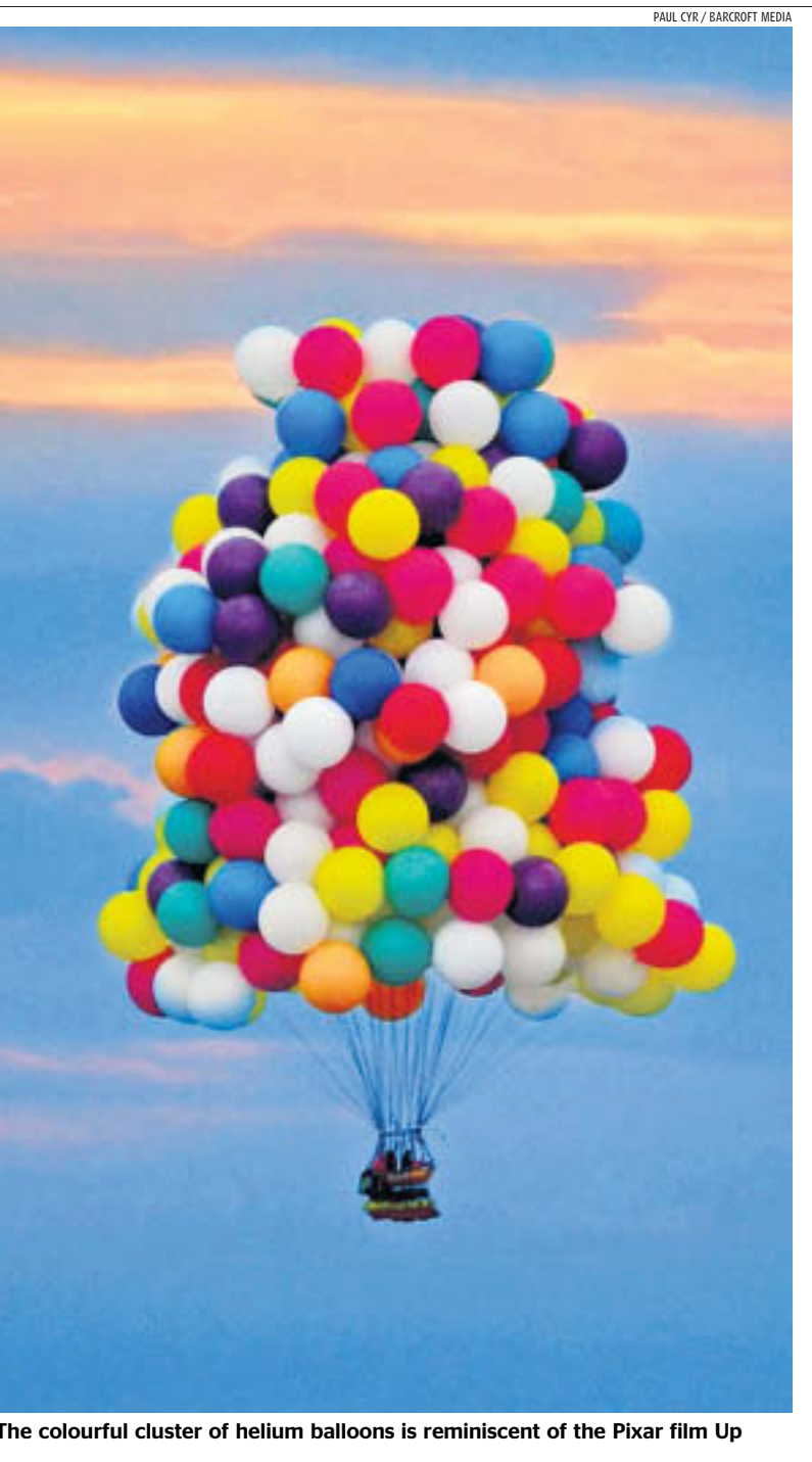
The colourful cluster of helium balloons is reminiscent of the Pixar film Up

along for that purpose. When asked why he had done it, he explained: "A man can't just sit around.