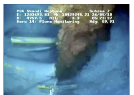
Scientists say this spill may show that oil plumes don't always float to the surface.